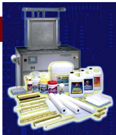
SMT PRODUCTION SUPPLIES & CLEANING EQUIPMENT CUSTOM & PRODUCTION MACHINING

Our commitment is not only to provide the highest quality understencil rolls possible, but to make them available to you for fast delivery through a network of local, national and international distributors. In addition to getting JNJ quality products, you add the benefit of doing business with local suppliers who can provide quick delivery and familiar service.