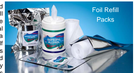
Foil Refill Packs

uum sealed Foil Refill Packs. The vacuum seal insures a longer shelf life that is guaranteed not to dry out and is