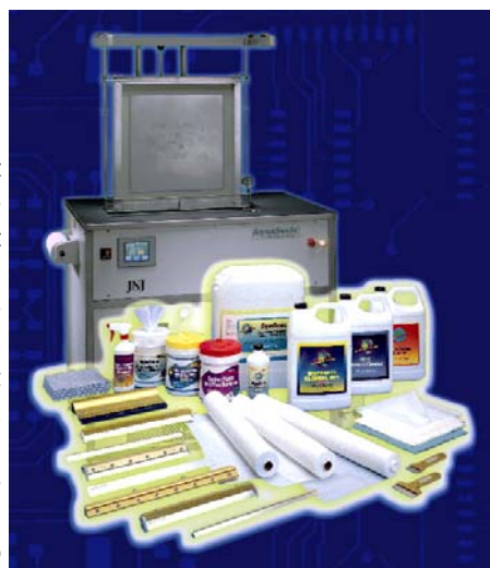
THE SOURCE SMT PRODUCTION SUPPLIES & CLEANING EQUIPMENT CUSTOM & PRODUCTION MACHINING

JNJ's commitment is not only to provide the highest quality products possible, but also to make them available for fast delivery through a network of local, national, and international distributors. In addition to obtaining JNJ quality products, our customers get the added benefit of doing business with local suppliers who can provide quick delivery and familiar service.